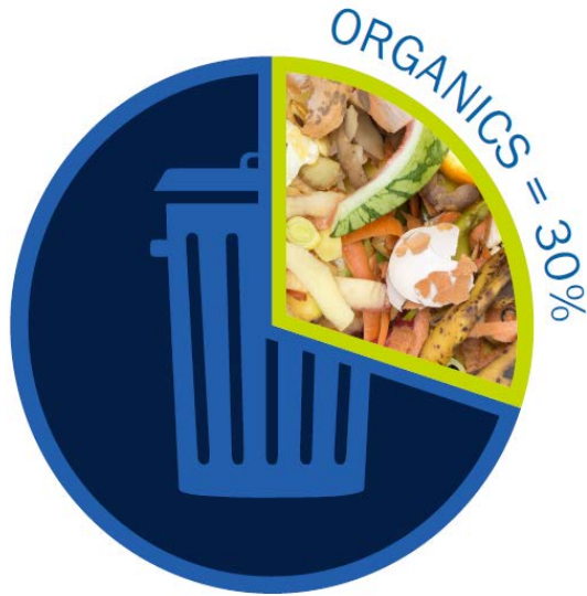
Current Landfill Waste